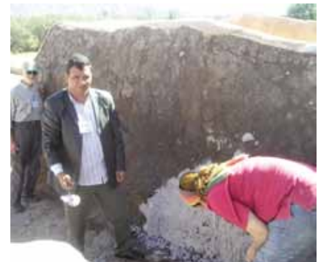
Figure 9: As part of an international training program funded by the U.S. Department of State, participants of TICRAT 2008 included a team of archeological site managers from Afghanistan.

sured in many ways. In the three Missions Initiative-funded TICRAT workshops held so far, 47 NPS employees, representing 15 park units throughout the Intermountain Region, have participated. Each of the TICRATs has also engaged with local communities elevating the status of local mission communities as drivers of heritage tourism as well as the investment in the traditional building trade professionals that are needed to sustain them. Equally important has been the involvement of university students of all disciplines, both domestic and international, who represent the next generation of cultural resource professionals and stewards of mission sites (Figure 10). To ensure that the impact of the content of each TICRAT extends beyond the participants' experience and is accessible to as broad an audience as possible, videos and digital presentations of each of the 2008 TICRAT sessions are available on the Missions Initiative website in both English and Spanish. These mate-