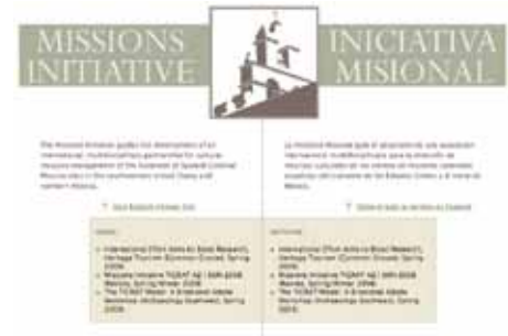
Figure 2: The Missions Initiative website, is a bilingual clearinghouse for the partnership's projects and activities and an increasingly important resource for technical content.

Mission sites are often thought of as singular buildings or objects needing to be conserved. For the Missions Initiative, our definition is intentionally broader and more inclusive. From our perspective, mis-