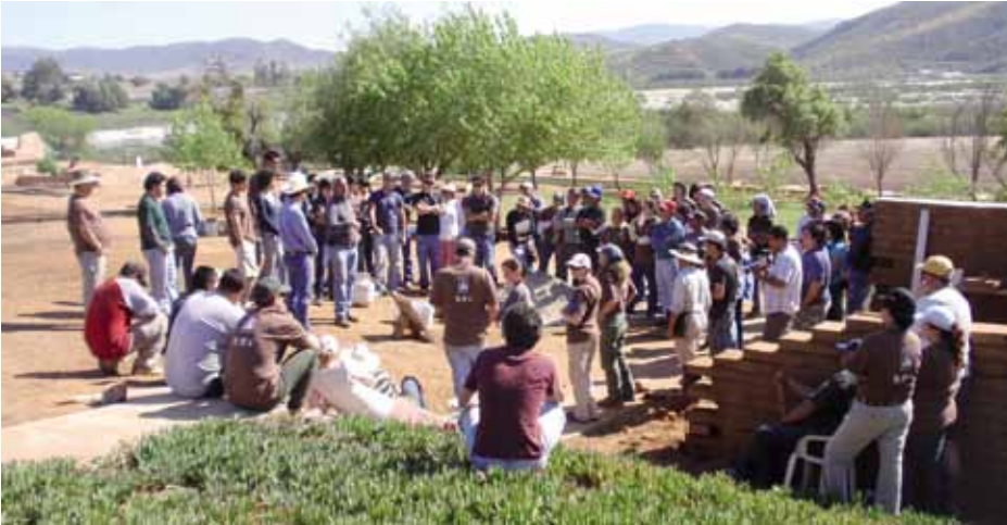
Figure 10: Since their inception, TICRAT workshops have engaged local university students and community members affiliated with the mission sites to build partnerships and pride that will help maintain traditional building practices in the community and foster heritage tourism for the community.