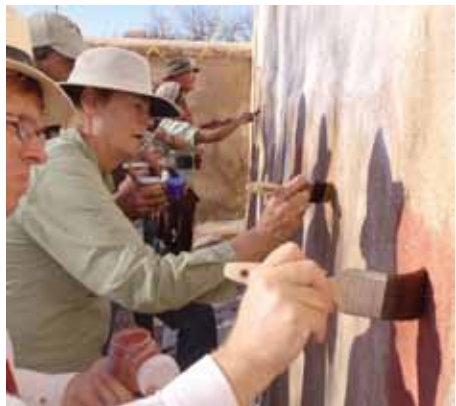
Figure 4: One module of TICRAT 2013 focused on the creation and application of a natural paint mixture made with pigments, cactus juice, and lime plaster.

The impact of the TICRAT model of assessment and preservation treatment of traditional building materials can be mea-