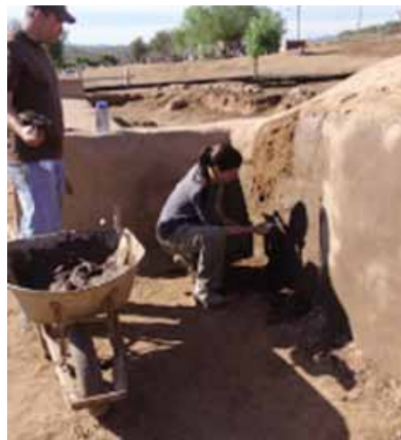
Figure 7: Mexican and American TICRAT 2011 participants work side-by-side on the mud plaster repair at Mision San Vicente Ferrer near Ensenada, Baja California, Mexico.