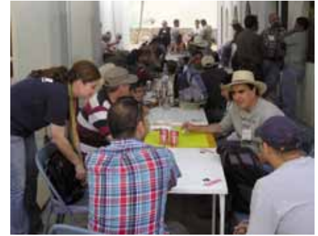
Figure 8: While the exchange of technical knowledge is one goal of the TICRAT workshops, another, equally important goal is sharing experiences and building relationships across disciplines, institutions, and international boundaries.

sured in many ways. In the three Missions Initiative-funded TICRAT workshops held so far, 47 NPS employees, representing 15 park units throughout the Intermountain Region, have participated. Each of the TICRATs has also engaged with local communities elevating the status of local mission communities as drivers of heritage tourism as well as the investment in the traditional building trade professionals that are needed to sustain them. Equally important has been the involvement of university students of all disciplines, both domestic and international, who represent the next generation of cultural resource professionals and stewards of mission sites (Figure 10). To ensure that the impact of the content of each TICRAT extends beyond the participants' experience and is accessible to as broad an audience as possible, videos and digital presentations of each of the 2008 TICRAT sessions are available on the Missions Initiative website in both English and Spanish. These mate-