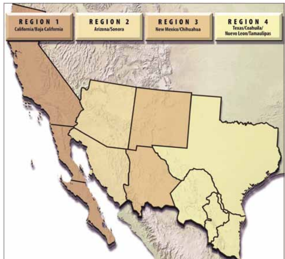
Figure 3: While representing a large geographic region, the Missions Initiative has identified sub-regions based on the north-south axes between American and Mexican states that were historically linked.