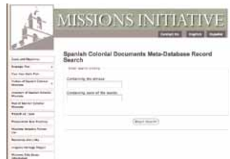
Figure 12: The Mission Sites Inventory and Meta-Database project has developed a web-based, keyword search portal to access records and citations for Spanish Colonial documentary materials housed in multiple collections.

This 2009 task agreement is ongoing and funded by San Antonio Missions NHP.