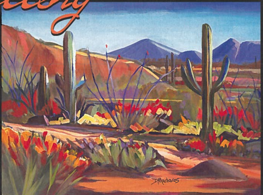
"Along the Red Mile"

Click on www.madaras.com for over 100 paintings