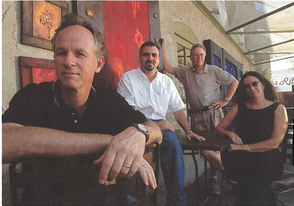
LEFT The Renaissance Revival style of the façade is expressed in the extensive brick detailing, which imitates stone voussoirs above the shallow arches of the second-story windows.